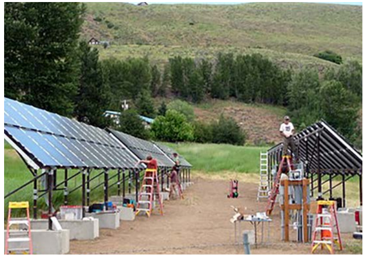
Winthrop Community Solar Project.

Preparing a No-Action Letter Request is a significant cost and time burden on project developers. Projects initiated by community groups, for example, may not have the resources to overcome this barrier. Work is underway, sponsored by the Department of Energy's SunShot Initiative, to bring clarity to the securities issue for shared solar projects at the federal level. However, the Securities Exchange Act of 1934 preserves much of the states' actions with regards to securities. 24 For this reason, state regulators will need to provide similar clarity at the state level.